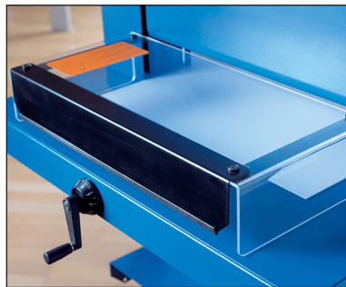
For protection, the blade will not move until this safety cover is placed in the down position.