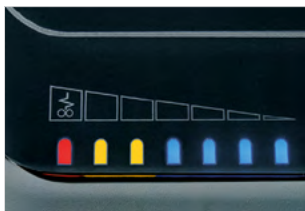
EPC: ELECTRONIC POWER CONTROL

Shows the shredding load required to optimize shredding without jams.