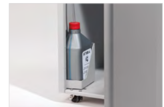
AUTOMATIC OILING SYSTEM

Heavy duty chain drive with steel gears which offer reliability and resistance to wear.