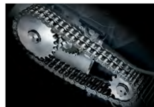
SUPER POTENTIAL POWER SYSTEM

Two entry openings and two sets of cutting knives for the separate insertion and shredding of paper and CDs/DVDs/credit cards.