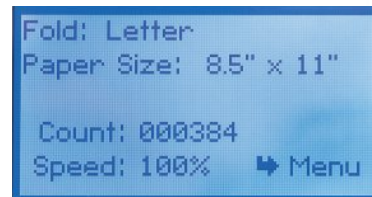
Large LCD Interface