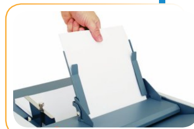
Optional Multi-Sheet Feeder