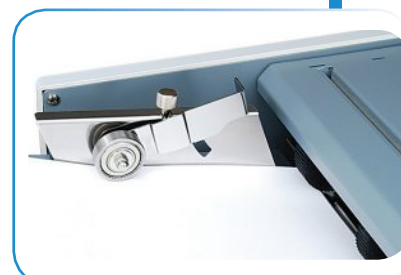
Cross Fold Guide

Formax – New Hampshire, USA www.formax.com