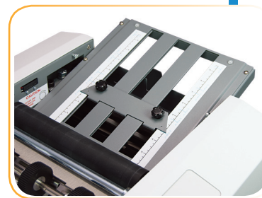
Redesigned fold plates - Clearly marked and easier to adjust