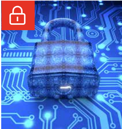
Your firewall stops intrusions into your pc.