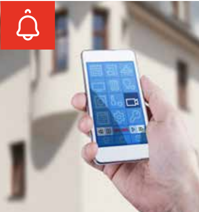
Your security system protects your valuable possessions.