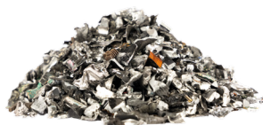
With 14 mm screen *