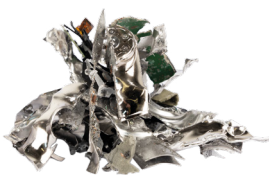
Without screen *