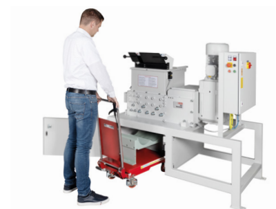
Simple and uncomplicated screen change