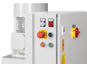
Operation via easy-to-understand push buttons