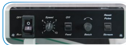
Easy-to-use control panel