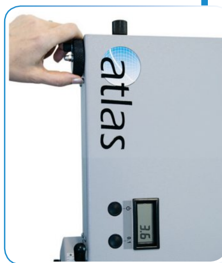
Fold adjustment knob and LCD readout