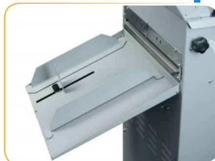
Perforation / score attachment, included

Formax - New Hampshire, USA www.formax.com